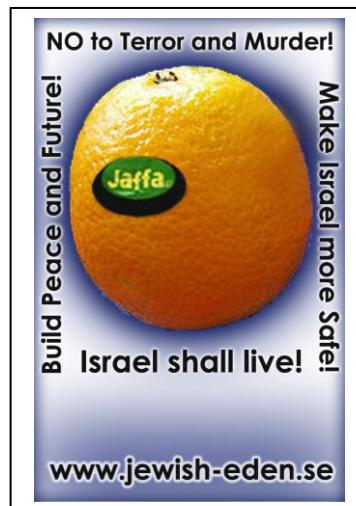
Peace-Badge Israel no.2B