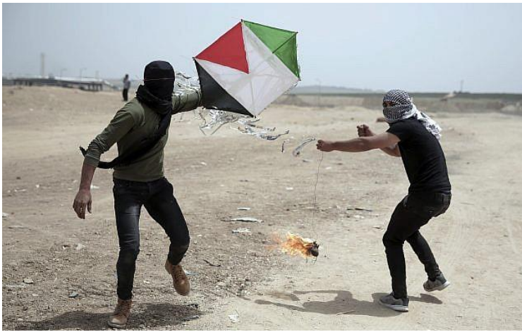
Palestinian protesters fly a kite with a burning rag dangling from its tail to during a protest at the Gaza Strip's border with Israel, April 20, 2018.

Hamas was less than enthusiastic about the Egyptian-brokered ceasefire deal reached on Saturday. When it was informed the deal was going into effect, the terror group launched dozens of rockets at Israeli communities on the other side of the border to register its discontent without completely refusing to accept it.