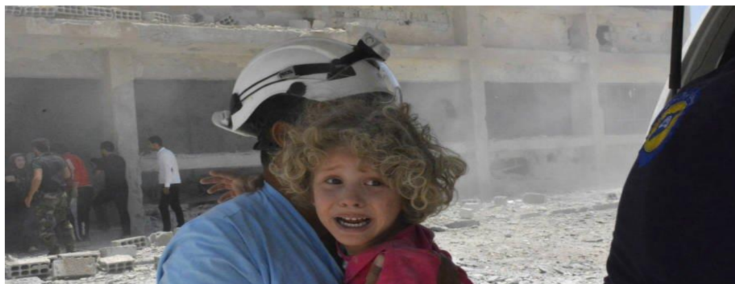
800 Syrian Rescue Workers Flee Country Via Israel

The United States, United Kingdom, and the European Union all expressed appreciation for what a top U.S. official called the "daring" rescue of over 400 members of the Syrian Civil Defense organization, also known as the White Helmets, and their families from southwestern Syria into Jordan.