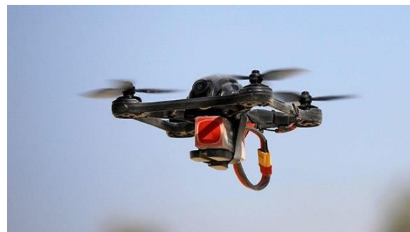
Drone used by IDF to fight incendiary balloons and kites

An accurate hit on an Iron Dome battery is one of Hamas's clear objectives, as this isn't merely another prestigious target, but a symbol—much like infiltration into an Israeli community, kidnapping a soldier or sabotaging the obstacle Israel is building on the border. And the simplest way to get to the Iron Dome batteries is by launching a drone that could drop an explosive on them, or blow up itself.