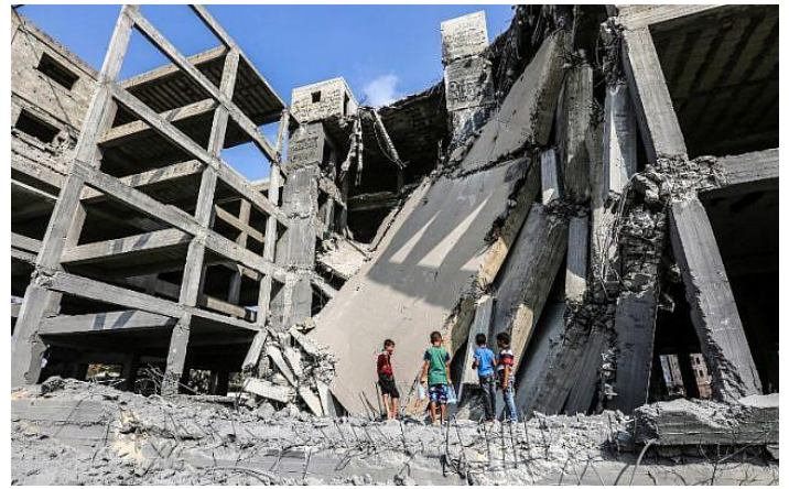
Palestinian boys walk through the wreckage of a building that was damaged by Israeli air strikes in Gaza City on July 15, 2018.

Firstly, the kites are not the most urgent security threat facing Israel but more like third or fourth down that list. Gaza has been downgraded, and is now regarded to be a less critical threat to Israel than the one posed by the Iranian military along the northern border in the sunset of the Syrian war.