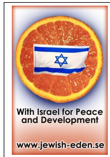
Peace-Badge Israel no.1B

To put on your fridge or give away to friends and family!