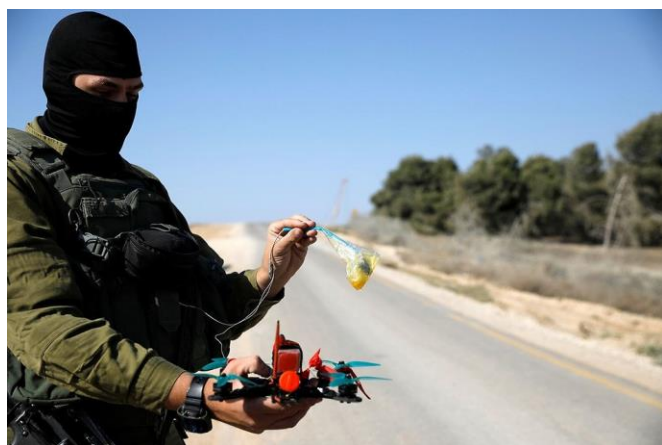
IDF soldier with drone that intercepted incendiary balloon from Gaza

After the third time that month that a drone infiltrated this town, it likely did not make its way back, and went down on the way. The IDF didn't report to the public about this incident, and to this day it only has vague comments to offer on it, despite the fact the findings collected from the front lawn that first time were presented to some of the town's residents.