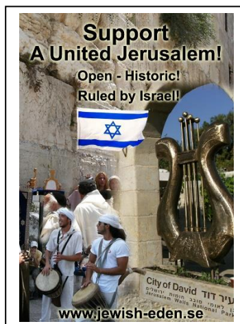
Peace-Badge Israel no.4

Jews, Muslims, Christians, and others have free access to all of Jerusalem today!