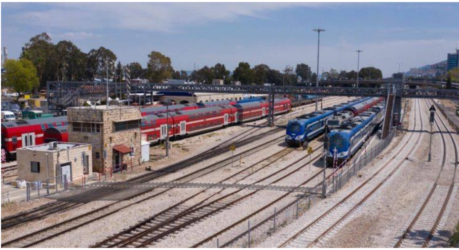
The train station near the port in Haifa.